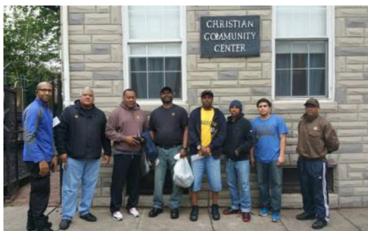
Front of Christian Community Center