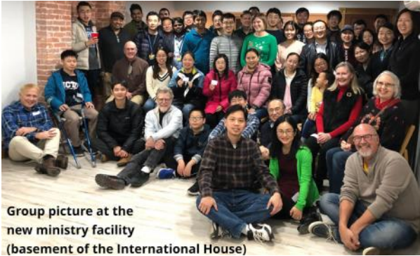
Group picture at the new ministry facility (basement of the International House)